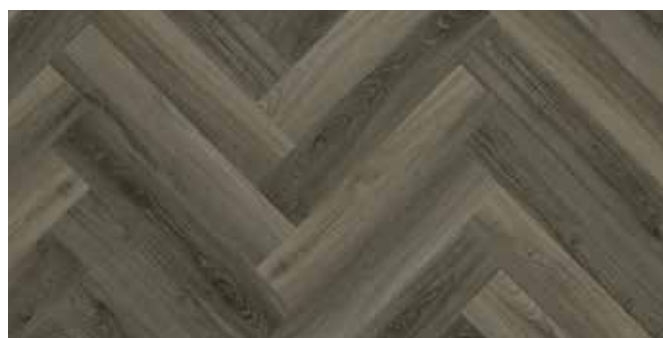
Lexington Oak Herringbone 125 mm x 625 mm