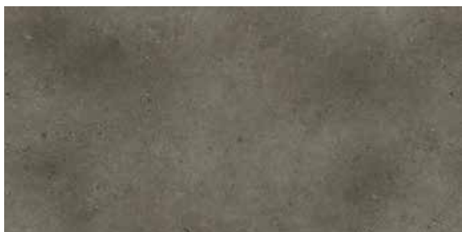
Florence Stone 305 mm x 610 mm