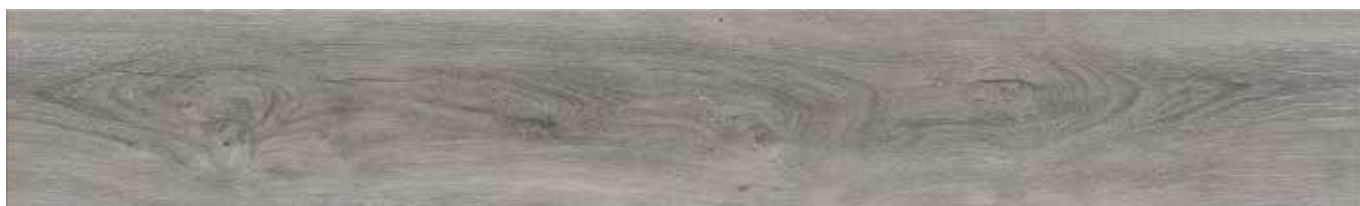
Concord Light Oak 180 mm x 1,220 mm