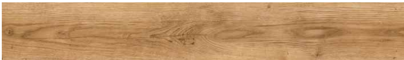
Denver Oak 180 mm x 1,220 mm