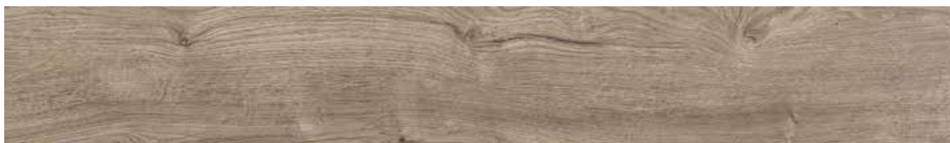
Boston Ash 180 mm x 1,220 mm