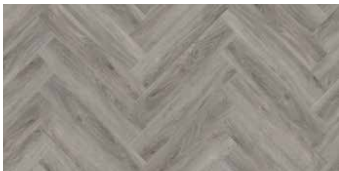
Concord Ash 125 mm x 625 mm