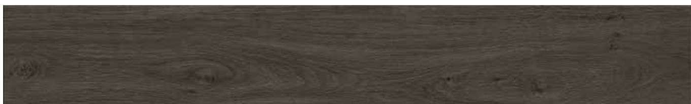
Amarillo Walnut 180 mm x 1,220 mm

Bring natural warmth into your space with our timeless wood finishes. Its life-like textures and rich tones create a welcoming ambiance, perfect for adding character to your interiors.