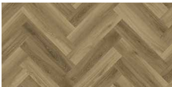
Wichita Beech Herringbone 125 mm x 625 mm

With its distinctive V-shaped pattern, herringbone flooring adds texture, movement, and sophistication to any room.